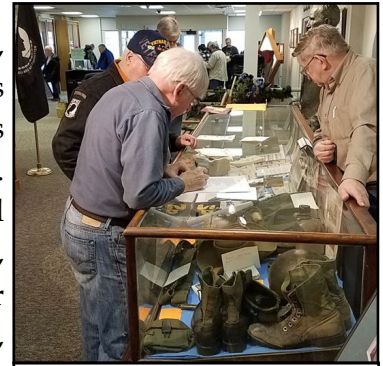
VVA members discuss objects used during the Vietnam War.

In March, the Hoard Historical Museum hosted the traveling exhibit, Wisconsin Remembers: A Face for Every Name , from the Wisconsin Veterans Museum. This exhibit featured a photo for each of the 1,161 Wisconsinites officially listed on the Vietnam Veterans Memorial in Washington, D.C. Alongside the traveling exhibit was a display of artifacts from the local chapter of the Vietnam Veterans of America, Blackhawk Chapter 409, Jefferson County. Members of VVA 409 generously loaned their military gear to display. In addition to artifacts, they also gave their time. Each Saturday, there were at least two VVA 409 members who were available for Museum visitors to talk with. They also shared their experiences with area school children who visited the exhibit. To VVA members, thank you very much!