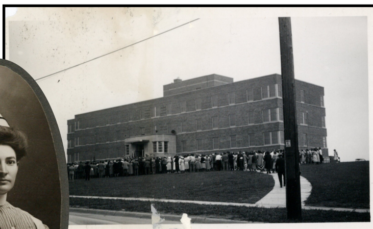
Dedication of Fort Memorial Hospital in 1950.