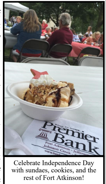
Celebrate Independence Day with sundaes, cookies, and the rest of Fort Atkinson!