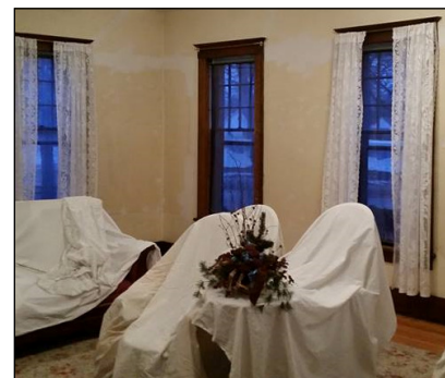
The parlor after plasterwork was completed but before new paint was applied. Even though the room was a mess, we couldn't help but decorate!

All of the paint colors selected were chosen by visitors. In December, visitors were given the opportunity to vote for their favorite paint color from several staff-approved colors for the hallway, library, and parlor. For those of you who voted, you may notice that the parlor is now blue rather than the pinks you voted on. During the voting, we had several write-in votes for a blue and one visitor voted and then returned with a paint swatch of the color he suggested on his ballot. Well, to be fair, we took the blue votes into consideration. Staff and volunteers then voted in a runoff election and decided that the blue was perfect for the room (and still historically appropriate). Thank you to all who voted, painted, and helped make the Hoard House feel like a home again!